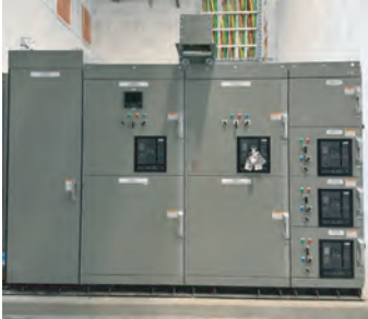
Metal Clad Switchgear 5KV/15KV, UL Listed