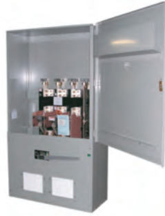
Bolted Pressure Switches 200 KAIC, UL Listed