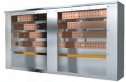
Bussed Troughway UL 1773